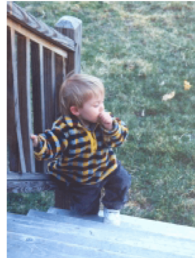
Children touching unsealed treated wood, and then putting their hands in their mouths is the biggest concern.

Too much arsenic can cause cancer. So it is good to prevent arsenic getting into your body when you can. When you touch wood treated with arsenic, you can get arsenic on your hands. The arsenic on your hands can get into your mouth if you are not careful about washing before eating. Young children are most at risk because they are more likely to put their hands in their mouths. The good news is that there are simple things you can do to protect yourself and your family from arsenic treated wood. This fact sheet will tell you how.